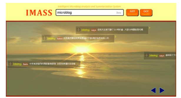
Figure 3. The IMASS interface

In this section, we show some snapshots of our summarization system with real examples using Plurk dataset. Our demo system is designed as a