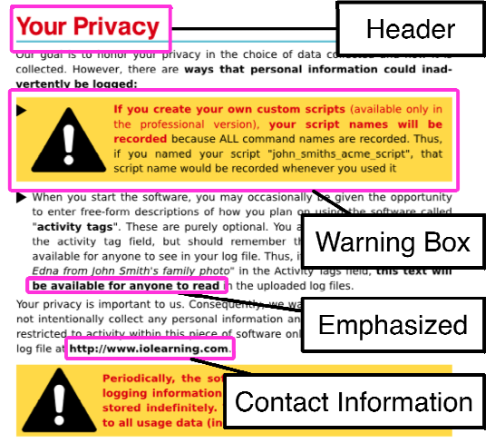
Figure 1. Example Textured Consent Document as designed by Kay and Terry (2010).

We report on ConsentCanvas as a work in progress. The system automates the labour intensive manual process used by Kay and Terry (2010). ConsentCanvas has a working implementation, but has not yet been formally evaluated. We also present the first available implementation of Kim and Chan's algorithm (2004).