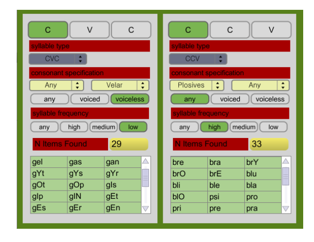
Figure 2: A snapshot of the part of the interface allowing configuration of syllable sets

The process starts with selecting the number of syllables in the current set, a number between one and four. Consequently, the selected number of 'syllable boxes' appear on the screen. Each box allows for a separate configuration of one syllable group. As can be seen in Figure 2, a syllable box contains a number of menus, and a text grid at the bottom of the box.