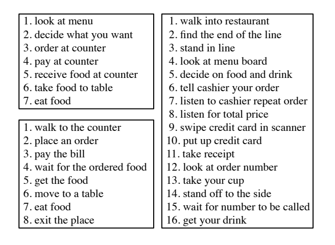
Figure 1: Three event sequence descriptions

of this scenario. We call a natural-language realization of an individual event in the script an event description , and we call a sequence of event descriptions that form one particular instance of the script an event sequence description (ESD) . Examples of ESDs for the FAST FOOD RESTAURANT script are shown in Fig. 1.