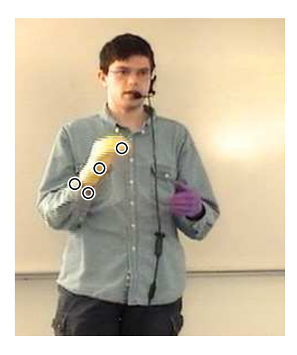
Figure 2: Circles indicate the interest points extracted from this frame of the corpus.

This visual feature representation is substantially lower-level than the descriptions of gesture form found in both the psychology and computer science literatures. For example, when manually annotating gesture, it is common to employ a taxonomy of hand shapes and trajectories, and to describe the location with respect to the body and head (Mc-Neill, 1992; Martell, 2005). Working with automatic hand tracking, Quek (2003) automatically computes perceptually-salient gesture features, such as symmetric motion and oscillatory repetitions.