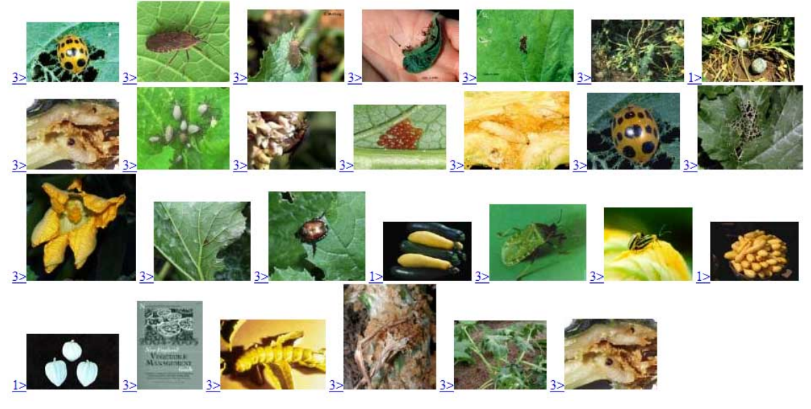
Figure 6: RELATED: SQUASH VEGETABLE cluster, consisting of 27 images. The algorithm discovered a specific SQUASH BUG-PLANT sense, which appears iconographic. Individual cluster purity for all senses was 0.85, and individual meta purity: 1.0. Global purity for all 40 clusters: 0.52. Most weighted tokens: bugs bug beetle leaf-footed kentucky .