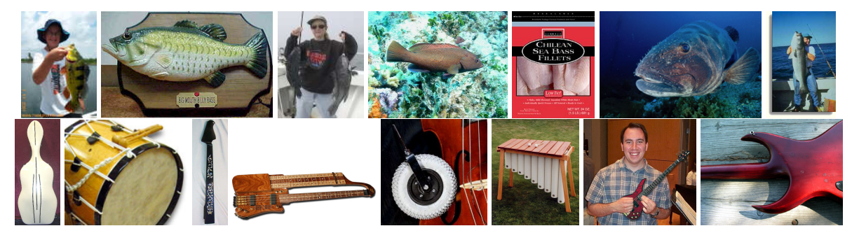
Figure 2: Which fish or instruments are BASS? Image sense annotation is more vague and subjective than in text.

vored corpus for WSD. As noted by (Yanai and Barnard, 2005), whereas current image retrieval engines include many irrelevant images, a data set of web images gives a more real-world point of departure for image recognition.