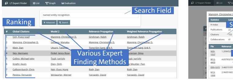
(a) Evaluation view: in this example, four different methods rank experts for the query "Named Entity Recognition". Click-ing authors opens the evidence view (cf. Figure 2b).