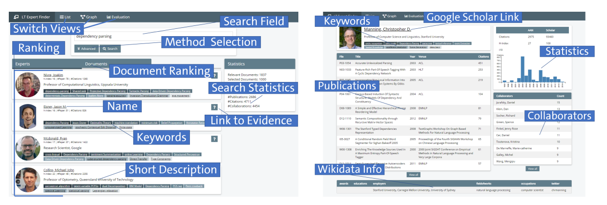
(a) List view: select a ranking method in the 'Advanced' tab, is-sue a search query, and get the results in a list view with concise author information as well as detailed result set statistics.