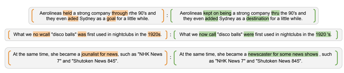
Figure 2: Example source-target pairs from each corpus.

ilar from each other. Thus, we compute a total of four corrupted datasets. The translations are obtained using a competitive machine translation system (Wu et al., 2016).