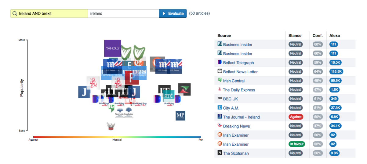
Figure 2: 360° Stance Detection interface. News articles about a query, i.e. 'Ireland AND brexit' are visualized based on their stance towards a specified topic, i.e. 'ireland' and the prominence of the source. Additional information is provided in a table on the right, which allows to skim article excerpts or follow a link to the source.

In order to evaluate a series of articles, enter a keyword to fetch the results from AYLIEN News API and another keyword to fetch the results from Stance Detection model. Please note that these two keywords could be different.