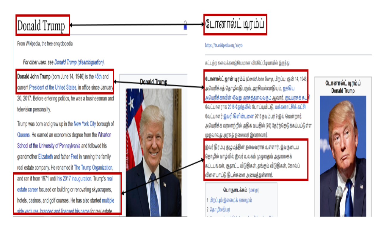
Figure 1: A side-by-side comparison of nearly parallel sentences from bilingual Wikipedia articles about Donald Trump in English and Tamil.