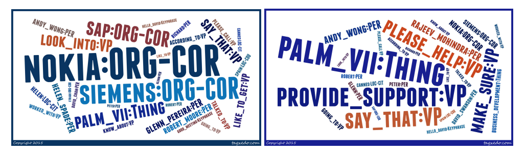
Figure 2: Word clouds of activity tokens.

body words not providing additional value in their task classification work. However, the GrausB(VP–TOI) in row (7) shows that using body terms more selectively has the potential for improving performance. Comparatively, the use of observed recipients (GrausR in row (8)) substantially improved recommendation results, yielding the highest MRR, precision@1, and precision@2 scores, while the generative baseline in row (5) retained the highest precision@5 and precision@10 scores.