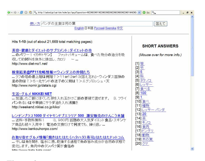
Figure 2: Results page for "What plant do Pandas eat?" in Japanese.

The average response time to present the full results page for a question in each language is currently around 10 seconds. The web-search and QA systems are run in parallel and the outputs combined when both are complete.