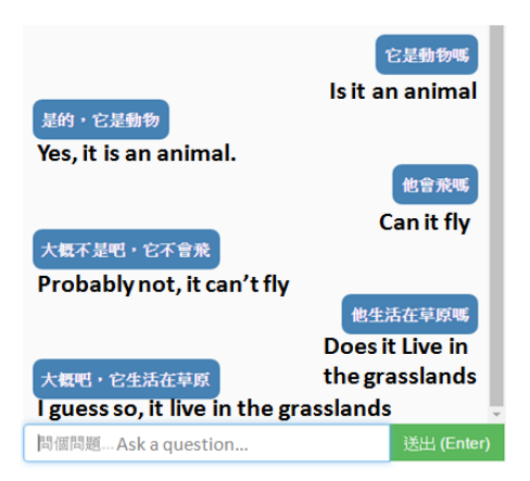
Figure 2: A running example (screenshot) with lion as the answer in Guess What.

cannot be found, a pattern matching procedure and a classifier trained with online textual resources, such as Google Search results, are further applied. Figure 1 shows the process flow.