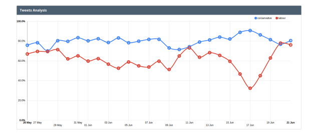
Figure 2: Negative sentiment trends for 'Labour' (red) and 'Conservative' (blue).

Figure 2 reveals consistently more negative sentiment towards 'Conservative' than 'Labour', especially for the week before election day (8 June).