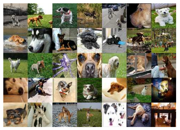
Figure 2: A subset of images associated with a node in ImageNet. The WordNet synset illustrated here is { Dog, domestic dog, Canis familiaris }

ciated relevant images. For such a resource, we turn to the ImageNet<sup>1</sup> database (Deng et al., 2009), which is a large-scale ontology of images developed for advancing content-based image search algorithms, and serving as a benchmarking standard for various image processing and computer vision tasks. ImageNet exploits the hierarchical structure of WordNet by attaching relevant images to each synonym set (known as "synset"), hence providing pictorial illustrations of the concept associated with the synset. On average, each synset contains 500-1000 images that are carefully audited through a stringent quality control mechanism. Compared to other image databases with keyword annotations, we believe that ImageNet is suitable for evaluating our hypothesis for two important reasons. First, by leveraging on reliable semantic annotations in WordNet (i.e., words in the synset), we can effectively circumvent the propagation of errors caused by unreliable annotations, and consequently hope to reach more conclusive results for this study. Second, unlike other image databases, ImageNet consists of millions of images, and it is a growing resource with more images added on a regular basis. This aligns with our long-term goal of extending our image-based similarity metric to cover more words in the lexicon. Figure 2 shows an example of a synset and the corresponding images in ImageNet.