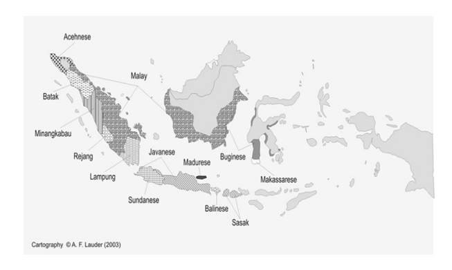
Figure 2. Major Indigenous Languages

The indigenous languages of Indonesia - also referred to as vernaculars or provincial languages, collectively called as Bahasa Nusantara - exhibits great variation in numbers of speakers. Thirteen of them have a million or more speakers, accounting for 69.91% of the total population. These languages are Javanese (75,200,000 speakers), Sundanese (27,000,000),Malay (20,000,000),Madurese (13,694,000), Minangkabau (6,500,000), Batak (5,150,000), Bugisnese (4,000,000), Balinese (3,800,000), Acehnese (3,000,000), Sasak (2,100,000), Makasarese (1,600,000), Lampungese (1,500,000), and Rejang (1,000,000) (Lauder, 2004).