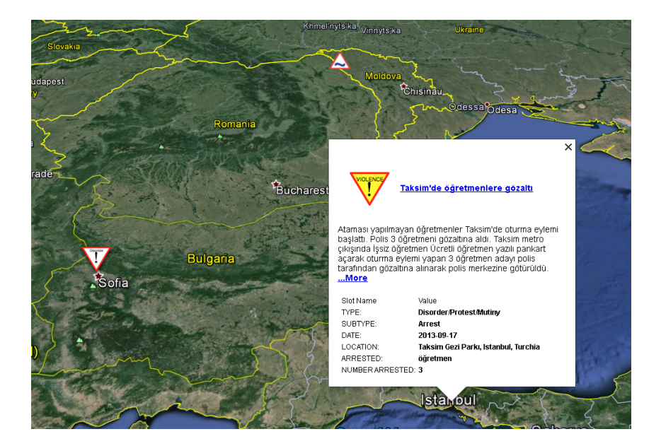
Figure 2: A sample output template of the system

constraints (e.g. Case) into event clause rules for Romanian language, we have enriched learnt lexical entries for the semantic classes with morphological annotations, using MULTEXT resources. For Turkish, as we do not currently perform morphological analysis, we have rather included common inflected forms of the applicable lexical entries, resulting in larger lexica.