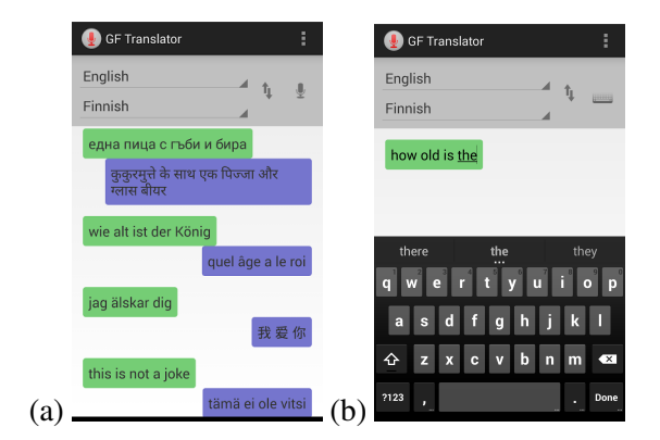
Figure 1: Translation between various languages with (a) speech (b) text input.

The app starts with the last-used language pair preselected for input and output. It waits for speech input, which is invoked by touching the microphone icon. Once the input is finished, it appears in text on the left side of the screen. Its translation appears below it, on the right, and is also rendered as speech (Figure 1 (a)).