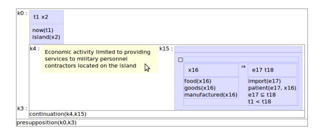
Figure 3: An example of the semantic representations in the GMB, with DRSs representing discourse units.

rhetorical relations. Clicking on discourse units switches the visualization between text and semantic representation. Figure 3 shows how DRSs are visualized in the Web interface.