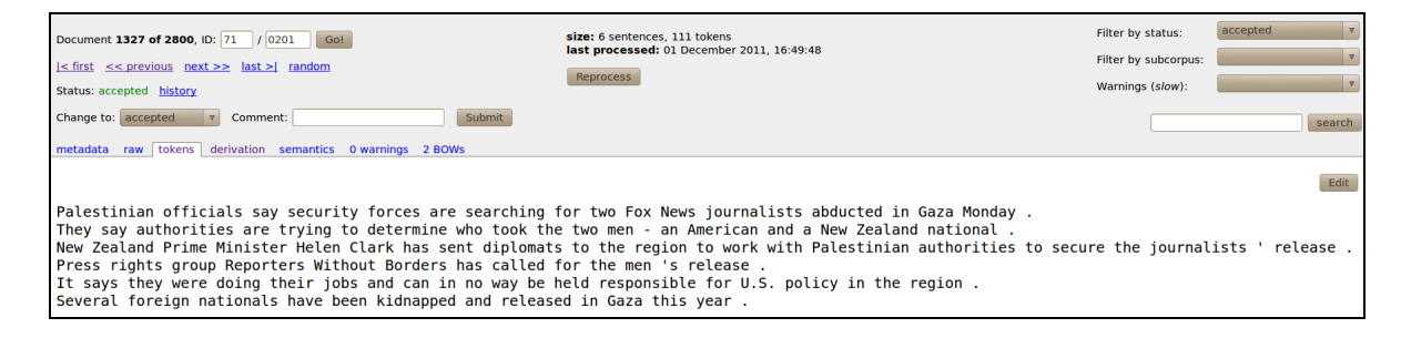
Figure 1: A screenshot of the web interface, displaying a tokenised document.

ing daemon', is responsible for calling make for the right document at the right time. It checks the database for new BOWs or manual reprocessing requests in very short intervals to ensure immediate response to changes experts make via the Web interface. It also updates and rebuilds the components in longer intervals and continuously loops through all documents, remaking them with the newest versions of the components. The number of make processes that can run in parallel is configurable; standard techniques of concurrent programming are used to prevent more than one make process from working simultaneously on the same document.