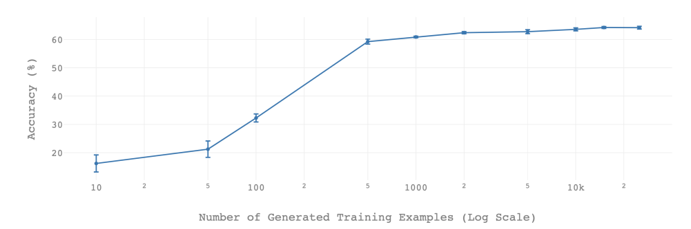
Figure 2: Above, we show how the accuracy of the final distilled model varies with the number of synthetic training examples generated by GPT-2. Error bars show the standard deviation of accuracies on five separate runs. The same GPT-2 model (trained on 100 examples per class, or a total of 1000 examples) was used to generate all synthetic texts.