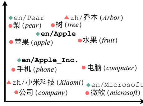
Figure 3: Embedding which includes entities in English, and words and entities in Chinese (English words in brackets are human translations of Chinese words).

Figure 2: Using Wikipedia inter-language links to generate sentences which contain words and entities in a source language ( e.g. , Chinese) and entities in a target language ( e.g. , English).