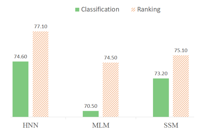
Figure 3: Comparison of different task formulation on WNLI.

The WNLI task can be formulated as either a ranking task or a classification task. To study the difference in problem formulation, we conduct experiments to compare the performance of a model used as a classifier or a ranker. For example, given a trained HNN, when it is used as a classifier we set a threshold to decide label (0/1) for each input.