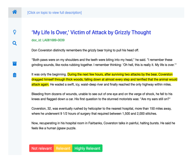
Figure 2: Screenshot of HiCAL using Birch to identify the most relevant sentences in a document retrieved for the query "black bear attacks".

Our notebooks are set up to allow relevance scores to be computed for an entire test collection in batch, and also to support interactive querying. When the user issues a query through the interactive notebook, candidate documents from the corpus are first retrieved using Anserini. A sentencelevel dataset is created on the fly from the initial ranking by splitting each document into its constituent sentences. Each sentence is fed into our BERT model to obtain a relevance score. These relevance scores are then aggregated with document scores to rerank the candidate documents, per Eq (1). The notebook setting allows a user to step through each part of the process and examine intermediate results to gain a better understanding of our approach.