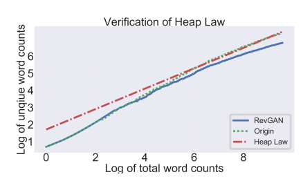
Figure 3: Verification of Heap's Law

by testing two major statistical laws of linguistics(Altmann and Gerlach, 2016): Zipf Law(Zipf, 1935) and Heap Law(Herdan, 1964). The former states that if words are ranked according to their frequency of appearance r=1,2,\cdots,V , the frequency f(r) of the r-th word scales with the rank as f(r)=\frac{\beta Z}{r^{\alpha}Z} , while the latter states that the number of different words V scales with database size N measured in the total number of words as V\sim N^{\alpha_H} . As shown in Figure 3 and 4, both the original reviews and the generated ones satisfy those two linguistic laws.