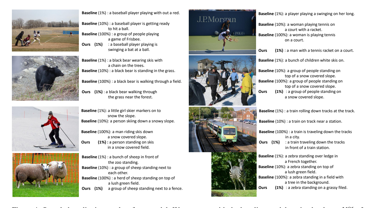
Figure 4: Sampled qualitative results of our model. We compare with the baseline models trained only on N% of paired samples out of the full MS COCO. Despite the use of only 1% paired data, our model generates plausible captions similar to that of the baseline models trained with more data (10% and above).