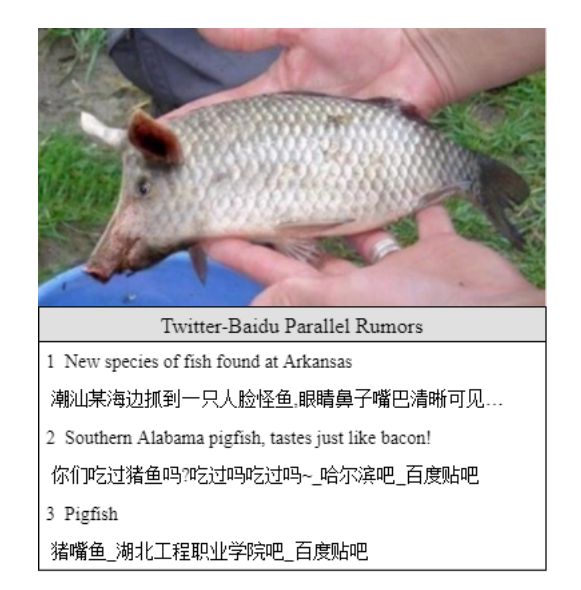
Figure 4: Example parallel rumors in the Pig fish event.