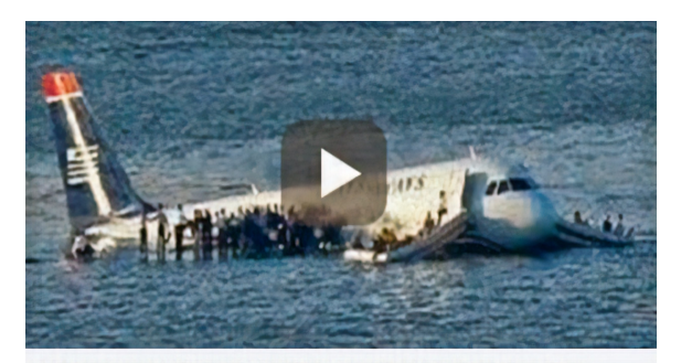
Malaysian Airlines Finally Found! Watch the video. news.yahoo.com | 594,298 people shared this video. VIRALGAG.NET

et al. (2015b) used forensics features for detecting multimedia fabrication to verify rumors. However, these features did not lead to noticeable improvement. We suspect that this is because un-tampered multimedia content can still convey false information when paired with fake news from a separate event. For example, Figure 1 shows one fake post on MH 370 that used a real video about US Airways Flight 1549. Inspired by the fact that readers