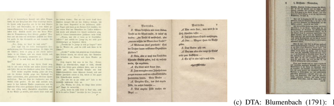
(a) Werther der Jude (1910)