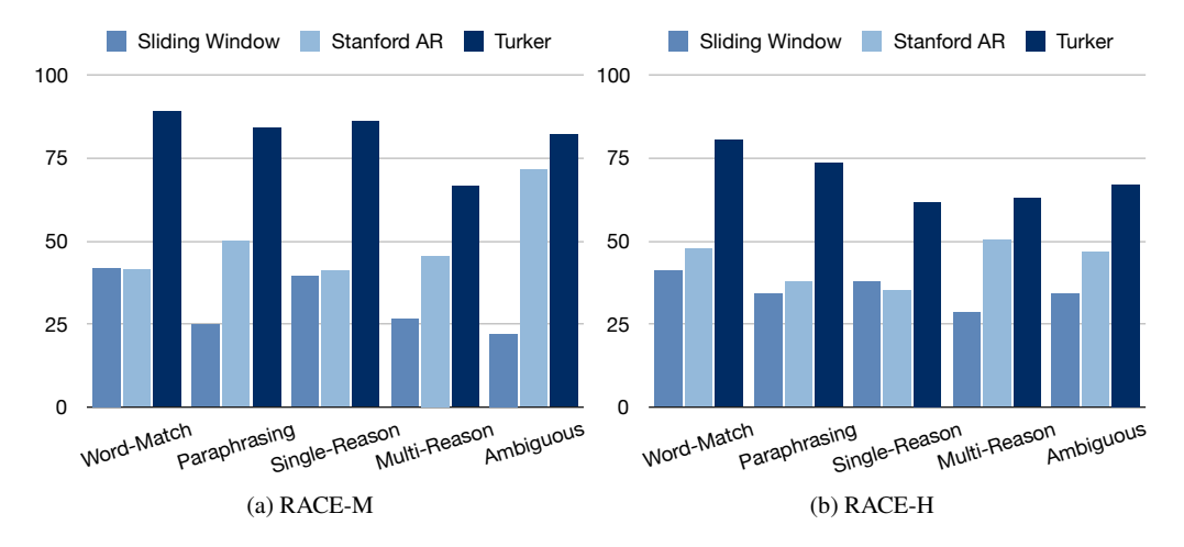
Figure 1: Test accuracy of different baselines on each reasoning type category introduced in Section 3.2, where Word-Match, Single-Reason, Multi-Reason and Ambiguous are the abbreviations for Word matching, Single-sentence Reasoning, Multi-sentence Reasoning and Insufficient/Ambiguous respectively.

a bilinear attention. We pass the scores through softmax to get a probability distribution. Specifically, the probability of option i being the right answer is calculated as