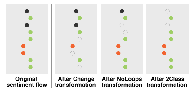
Figure 3. The original sentiment flow from Figure 2 and the resulting flow for each of the three proposed transformations.

NoLoops Deletion of repeating sequences of two or more local sentiments. The rationale is to reduce length differences by merging similar sub-reviews.