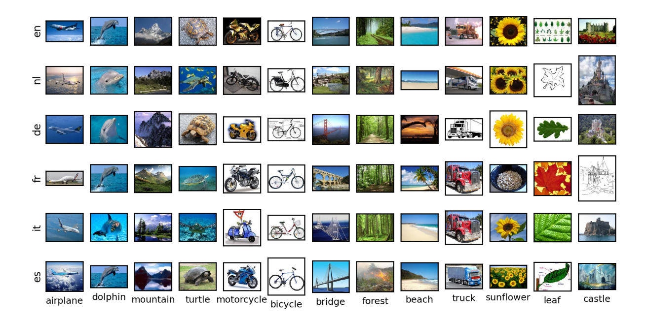
Figure 2: Example images for the languages in the Bergsma and Van Durme dataset.