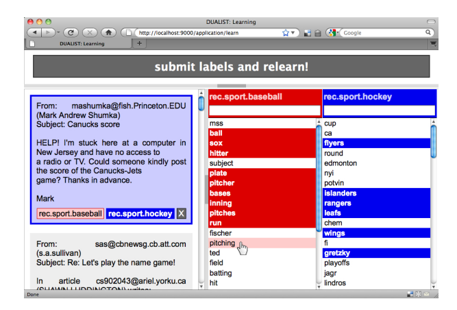
Figure 1: A screenshot of DUALIST.

The rationale for these columns is that they should reduce cognitive load (i.e., once a user is in the base-ball mindset, s/he can simply go down the list, labeling features in context: "plate," "pitcher," "bases," etc.). Within each column, words are sorted by how informative they are the to classifier, and users may click on words to label them. Each column also contains a text box, where users may "inject" domain knowledge by typing in arbitrary words (whether they appear in any of the columns or not). The list of previously labeled words appears at the bottom of each list (highlighted), and can be unlabeled at any time, if users later feel they made any errors.