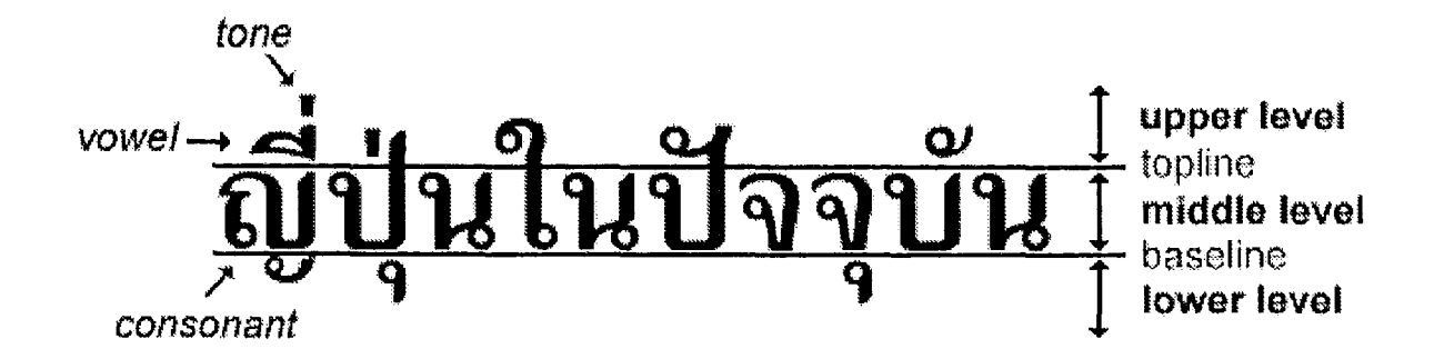
Figure 1: No explicit word delimiter in Thai

feature-based approaches are very effective for solving this problem.