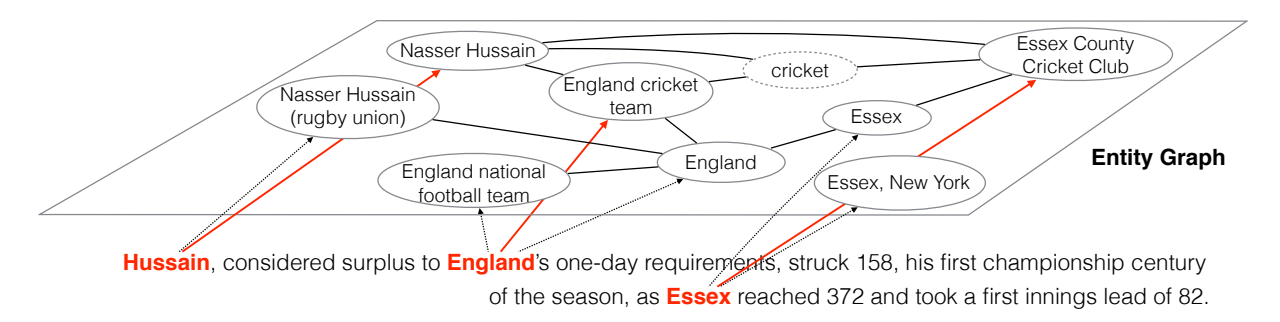
Figure 1: Illustration of named entity disambiguation for three mentions England , Hussain , and Essex . The nodes linked by arrowed lines are the candidate entities, where red solid lines denote target entities.

information of consistent topic "cricket" among adjacent mentions England , Hussain , and Essex . Although the global model has achieved significant improvements, its limitation is threefold: