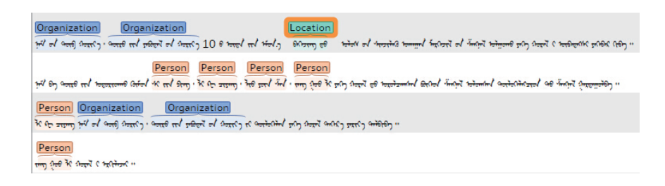
Figure 1: The annotation platform for Mongolian NER.

Mongolian named entity recognition. This paper introduces the work on Mongolian NER that is still in progress.