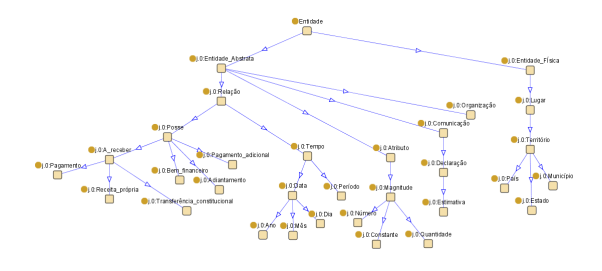
Figure 3: The domain ontology

Finally, based on this information this module selects from a set of pre-defined question patterns linking concepts of the domain ontology with SQL commands, the one which contains the largest number of concepts in common with the input, and sends it to the manager in an XML format. If there is no complete frame, this module identifies which concepts are missing and returns this in the XML output.