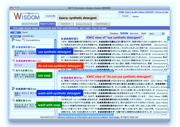
Figure 2: A view of major, contradictory and contrastive statements in WISDOM.

To detect such unidentified contrastive relations, it is necessary to robustly extract contrastive keyword pairs. In the future, we will employ a bootstrapping approach to identify patterns of direct contrastive statements and contrastive key-