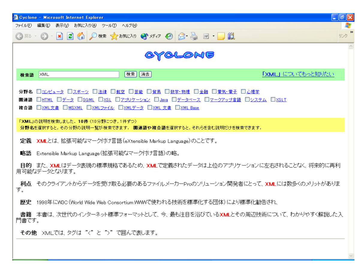
Figure 3: Example summary for "XML".