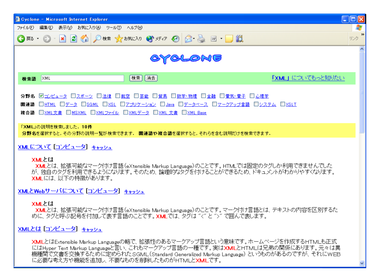
Figure 1: Example descriptions for "XML".