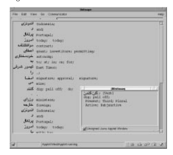
Figure 2: The Glosser interface

While this is already enough information to facilitate a basic word-for-word translation, in general a morphological analyzer for the source language is needed to translate real-world text. For MEAT, one can either import the results of an existing morphological analyzer, or use the native description language, based on a finite-state transducer using characters as left projections and typed feature structures as right projections (Zajac, 1998). After completing the morphological analysis of the source language and specifying the mapping of lexical features to English, glossing is available. The Glosser is an MEAT application consisting of morphological analysis of source language words, followed by dictionary lookup for single words and compounds, and the translation into English inflected word forms. An example of the interface for the glosser is shown in Figure 2.