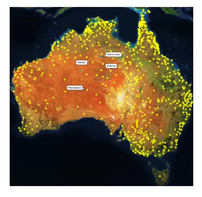
Figure 1: First Languages map of Australia with indicative locations for speakers of Kaytetye, Pitjantjatjara, Warlpiri and Warumungu. Image adapted from Gambay.

This system was designed with the following questions in mind: (1) Are vowels distributed