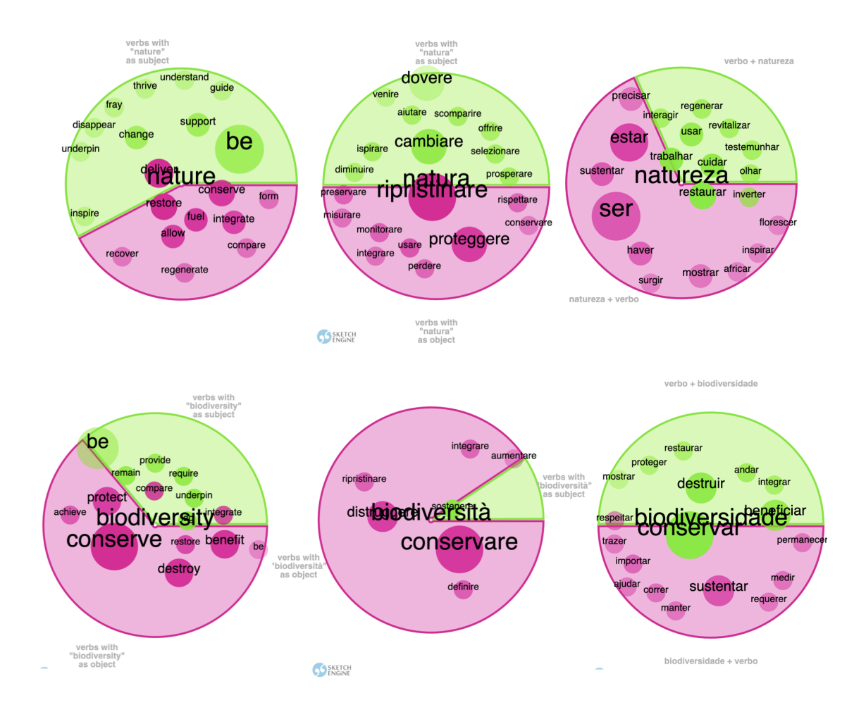
Figure 1: Behavior of 'nature'/'nature'/'natureza' and 'biodiversity'/'biodiversità'/'biodiversidade' with verbs.

subcorpora also shows that there are important differences among them and that the focus of the discourse is not exactly the same in the three versions of the WWF's report.