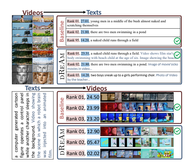
Figure 3: Retrieval examples by the baseline and DREAM. "Rank x" means that the example is ranked at x. The numbers in blue represent the similarity to the query. Texts in blue and video frames surrounded by green lines are augmented data.

OLMo (Groeneveld et al., 2024). For generating semantically similar video frames, we use ControlNet (Zhang et al., 2023) and Instruct-Pix2Pix (Brooks et al., 2023). We notice that for text paraphrasing, both LLaMA and OLMo are able to grasp the main idea based on the input and generate semantically similar texts. For video frame generation, though the generation for a frame is independent of other frames, we still observe that ControlNet can generate frames within a similar style,