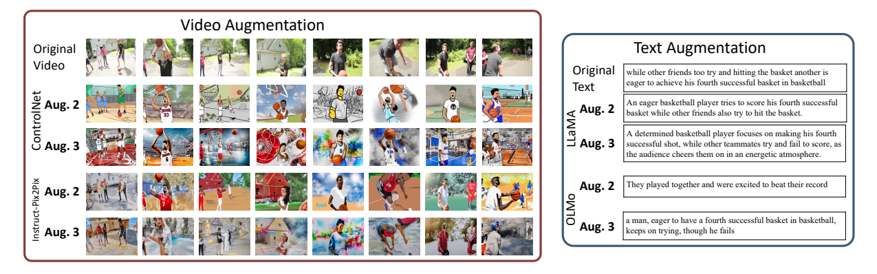
Figure 4: Qualitative examples of data generated by DREAM. "Aug. 2" and "Aug. 3" refer to augmentation by text paraphrasing and video stylization and augmentation by relevance enhancing.