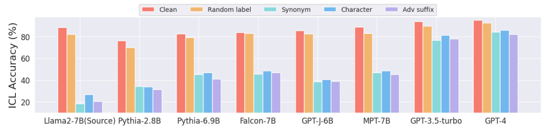
Figure 1: Experimental results of transferring poisoned data from Llama2-7B to other models. The Y-axis represents the ICL accuracy (a smaller value represents a stronger poisoning effect), while the X-axis denotes different models.

treme case of 100% poisoning rate<sup>4</sup>. A more practical attacking scenario with small poisoning rates is discussed in Section 5.3.