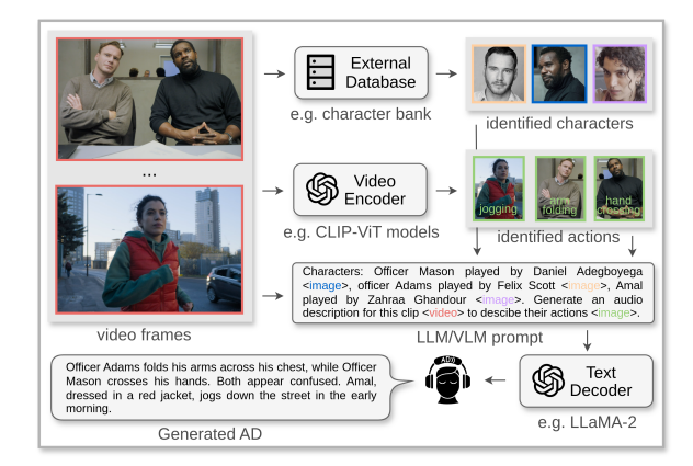
Figure 3: Process of DVC : it is often composed of two sub-tasks, i.e., visual feature extraction (VFE)—where a visual encoder decides whom and what to describe, and dense caption generation (DCG)—where a text decoder works on how to describe. Film taken as example: Baghdad in My Shadow (2019) .

Dense video captioning (DVC) addresses the challenge of establishing connections between clips in videos and their natural language descriptions (Qasim et al., 2023). The term dense in DVC signifies the aim to capture as much information as possible to fit the description requirements, which makes DVC a necessary step for AD generation. Typically, DVC outputs multiple sentences as descriptions (Liu and Wan, 2021).