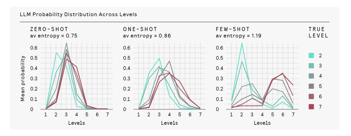
Figure 4: Average probability distributions for zero-, one-, and few-shot settings.