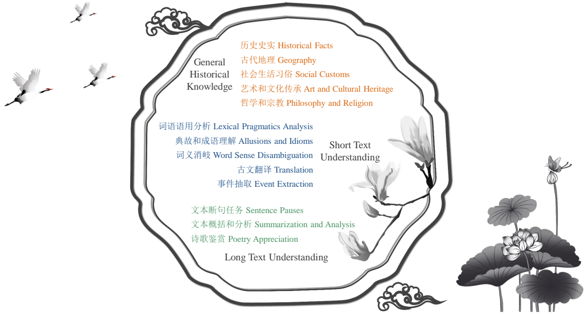
Figure 1: Overview of AC-EVAL.

proficiency in ancient Chinese language understanding and historical knowledge. AC-EVAL comprises 3,245 multiple-choice questions, spanning three distinct dimensions and thirteen subjects, covering historical periods from the Pre-Qin to the Qing dynasty. These tasks, which progressively increase in difficulty, are categorized into general historical knowledge, short text understanding, and long text understanding. The general historical knowledge tasks address a diverse range of contents, including but not limited to, ancient historical facts, geography, social customs, art, religion and philosophy. Short text understanding covers lexical semantics and pragmatics, allusions and idioms, sentence translations, and event extraction. Long text understanding tasks focus on long text pauses, classical prose summarization and analysis, and the appreciation of themes, emotions and styles in poetry.