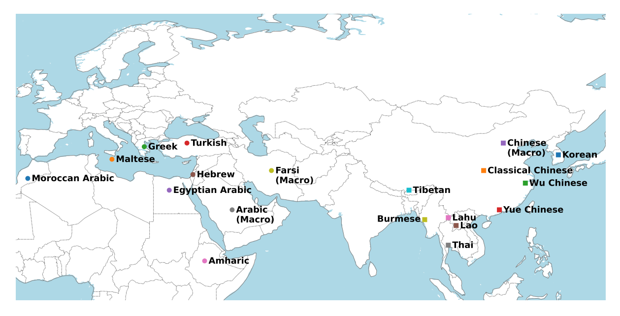
Figure 2: Geographical distribution of languages selected in each group. Mediterranean-Amharic-Farsi are shown with circles, while South+East Asian Languages are shown with squares.