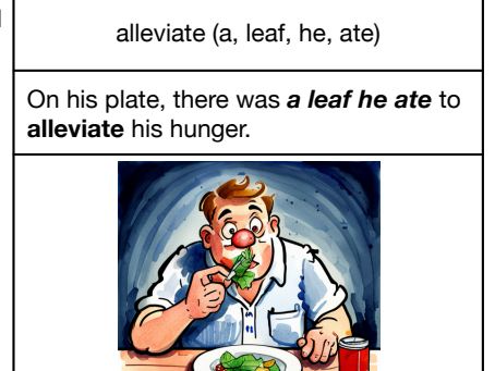
Figure 1: An example of human-authored verbal cue (Geer and Geer, 2018) for the target word " alle-viate " and visual cue generated by Stable Diffusion XL. We study automated verbal cue generation in this work and leave visual cue generation for future work.

by verbal and visual cues. This technique is used in many language learning resources, from traditional books (Burchers et al., 2000; Heisig, 2011; Geer and Geer, 2018) to modern community-based learning platforms (Mnemonic Dictionary, 2024; Koohii Kanji, 2024), where users contribute mnemonics and the community vote on their effectiveness.