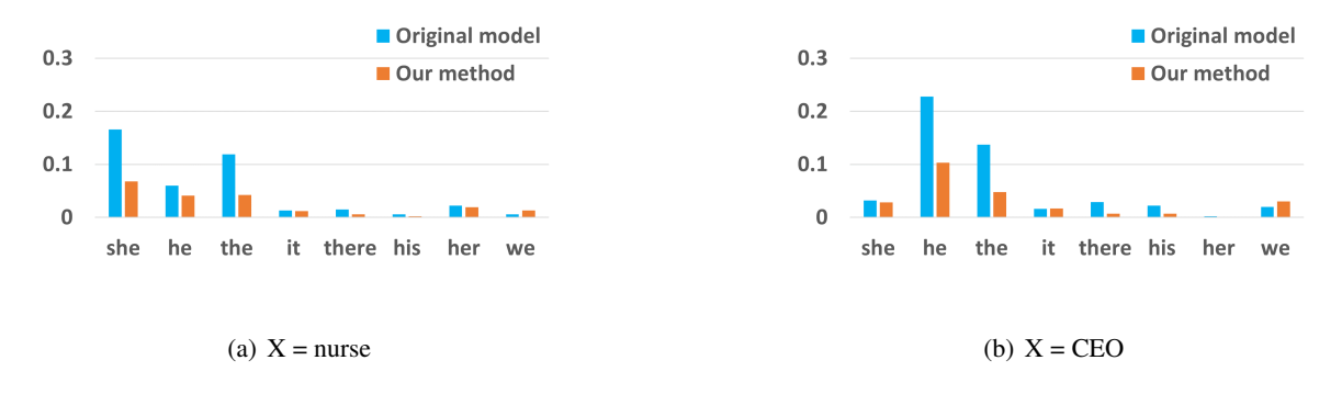
Figure 2: The effect of our method on the conditional probability distribution for the prompt "When the X walked into the room," (X=nurse, CEO). There is a smaller gap between the probability for "she" and "he" after training with our method.