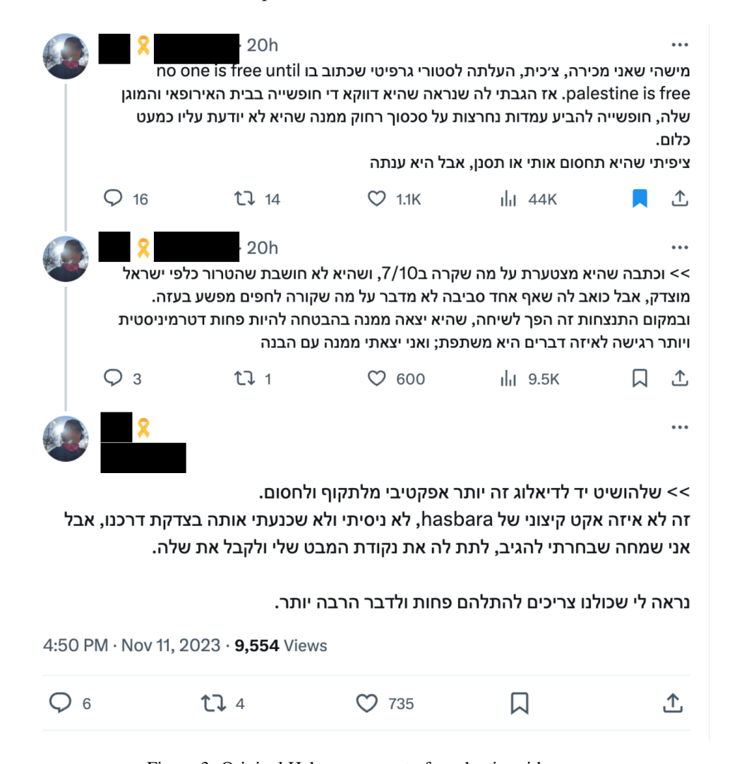
Figure 3: Original Hebrew account of productive sidcourse

The original account of the productive discourse is provided in Figure 3. The English translation is presented in the Ethics and Broader Impact section.