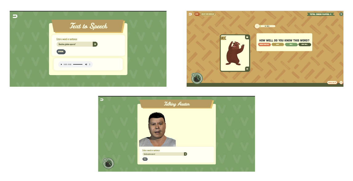
Figure 2: Integration of text-to-speech system as standalone component (upper left), in the flashcard activity (upper right), and with talking avatar (bottom).

projects of 300-500 utterances, and speakers were instructed to talk as if they were speaking to a learner of Ojibwe, and to re-record any utterances with pauses, disfluencies, or missing words. Furthermore, our speakers could edit text within the application if they noticed a typo, wanted to change a word to better fit their dialect, or change spelling to better match the conventions of the community. This was a critical feature, as the texts represented a range of sub-varieties within the Southwestern group. These corrected and adapted versions were used as the transcriptions for the model training. To ensure all portions of the audio were captured, we built-in a pre-recording delay of 1,000 ms and a post-recording delay of 500 ms. All audio was recorded as a .wav file on a single channel at a rate of 44,100 Hz and a 16 bit depth.